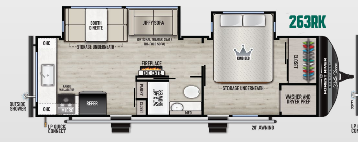
Hitch (LBS): 780 Ext. Length: 31'10" Ext. Height: 11'3" Ext.Width: 96" UVW (LBS): 7,243 CCC (LBS): 2,337 Tanks - F/B/G - (GAL): 40/30/90